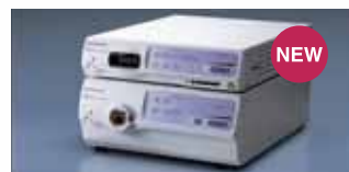
EVIS EXERA II™ Universal Platform