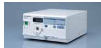
OTV-SI Compact OFFICE Video System

Specifications, design and accessories are subject to change without any notice or obligation on the part of the manufacturer.