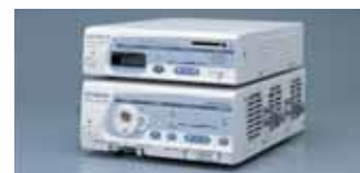
VISERA Video System